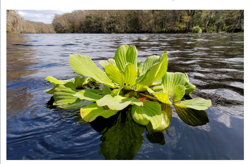
Water Lettuce in Fisheating Creek, Florida.